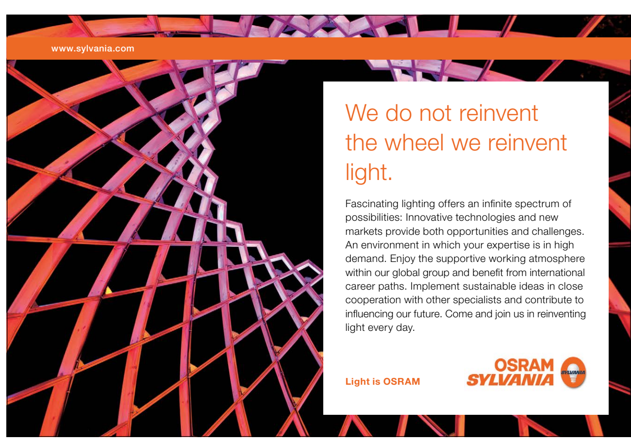
Download free eBooks at bookboon.com